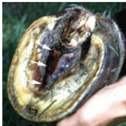
Deep infected cleft in frog associated with 'thrush'

It is usually caused by a bacterial (or less commonly, fungal) infection that enters the central and lateral sulcus of the frog. One species of bacterium ( Fusobacterium necrophorum ) is particularly aggressive, invading and destroying the frog, sometimes exposing the deeper sensitive tissues. Long heel conformation encourages the development of deep narrow frog sulci which are more prone to the development of thrush, if environmental conditions are right.