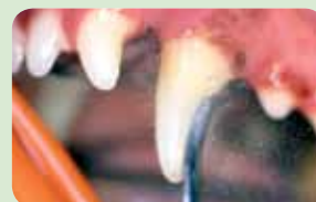
Removing the calculus using an ultrasonic scaler, followed by polishing the teeth is a very effective form of treatment