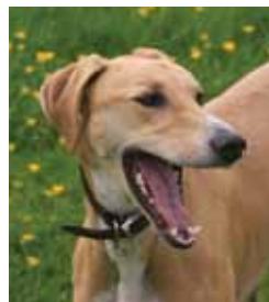
The progression of gum disease in pets

Unfortunately once a tooth becomes loose, the problem is usually too advanced to save that tooth. However if gum problems are identified at an earlier stage, a combination of a Scale and Polish and ongoing Home Care can make a real difference to your pet's oral health (and also their breath!). Please contact us today for a dental check-up!