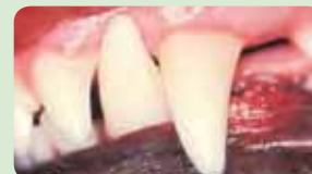
(1) Healthy mouth