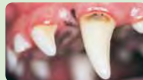
(2) Gingivitis – with early calculus